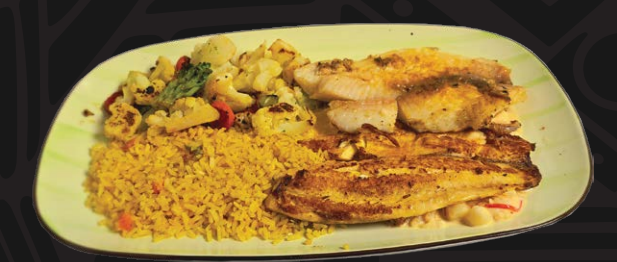
Filete de Pescado